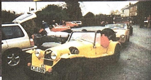
Cars in a line ready to be started by the start official.