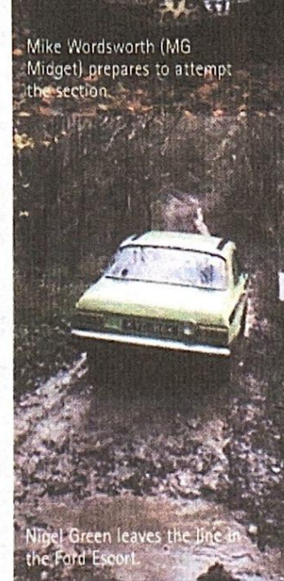
Nigel Green leaves the line in the Ford Escort.