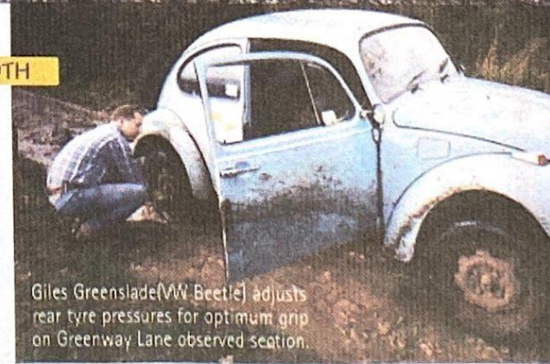
Giles Greenslade (VW Beetle) adjusts rear tyre pressures for optimum grip on Greenway Lane observed section.